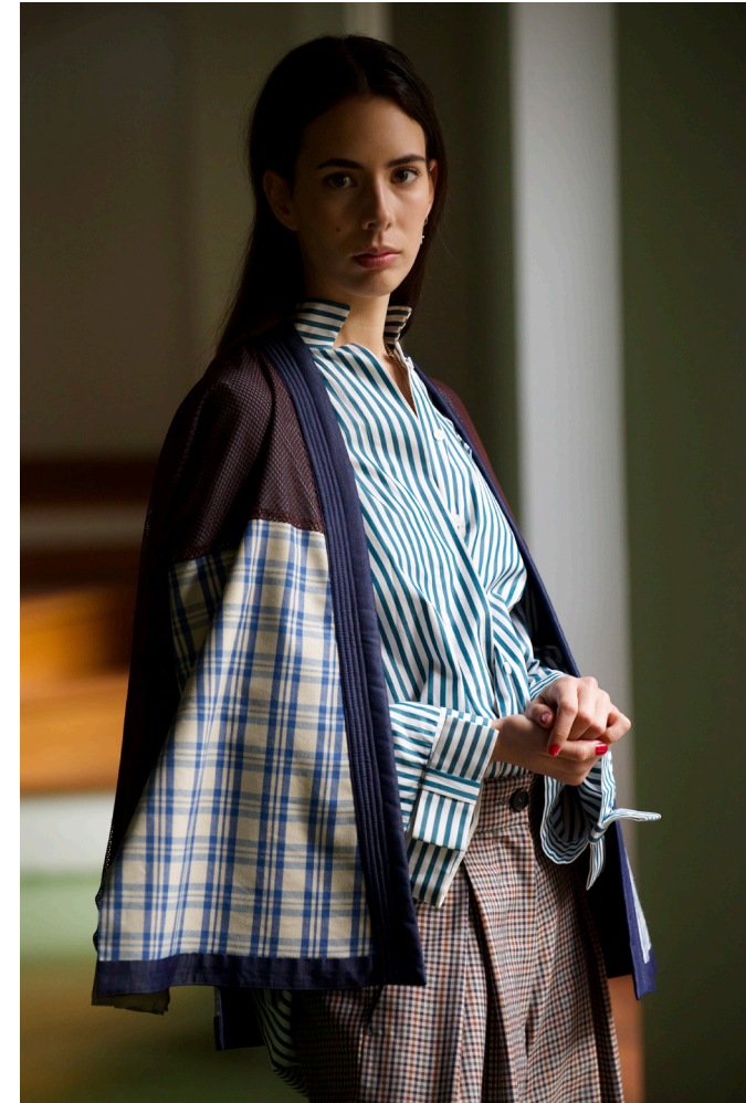
Indigo Denim Jacket with sleeve patch / lined in check cotton and burgundy net.