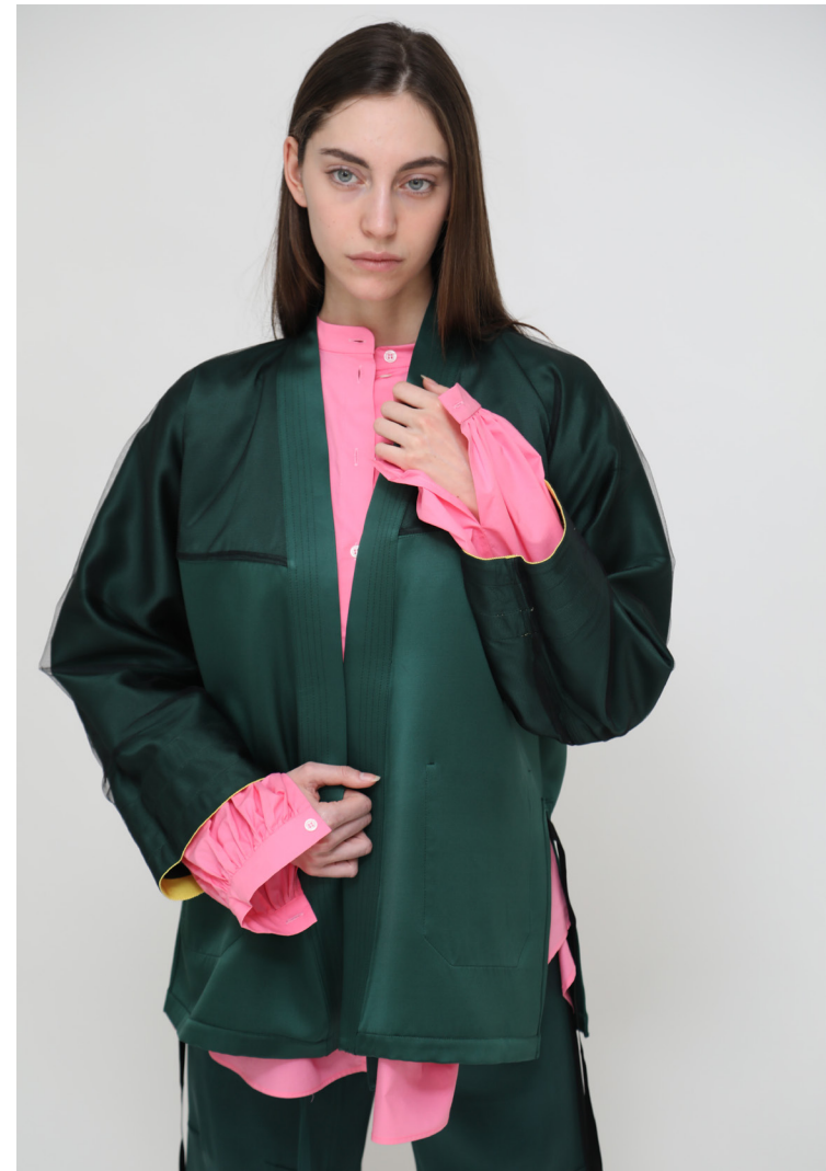
Jade Jacket silk and wool satin/ yellow grosgrain trim/ black tulle half lining.