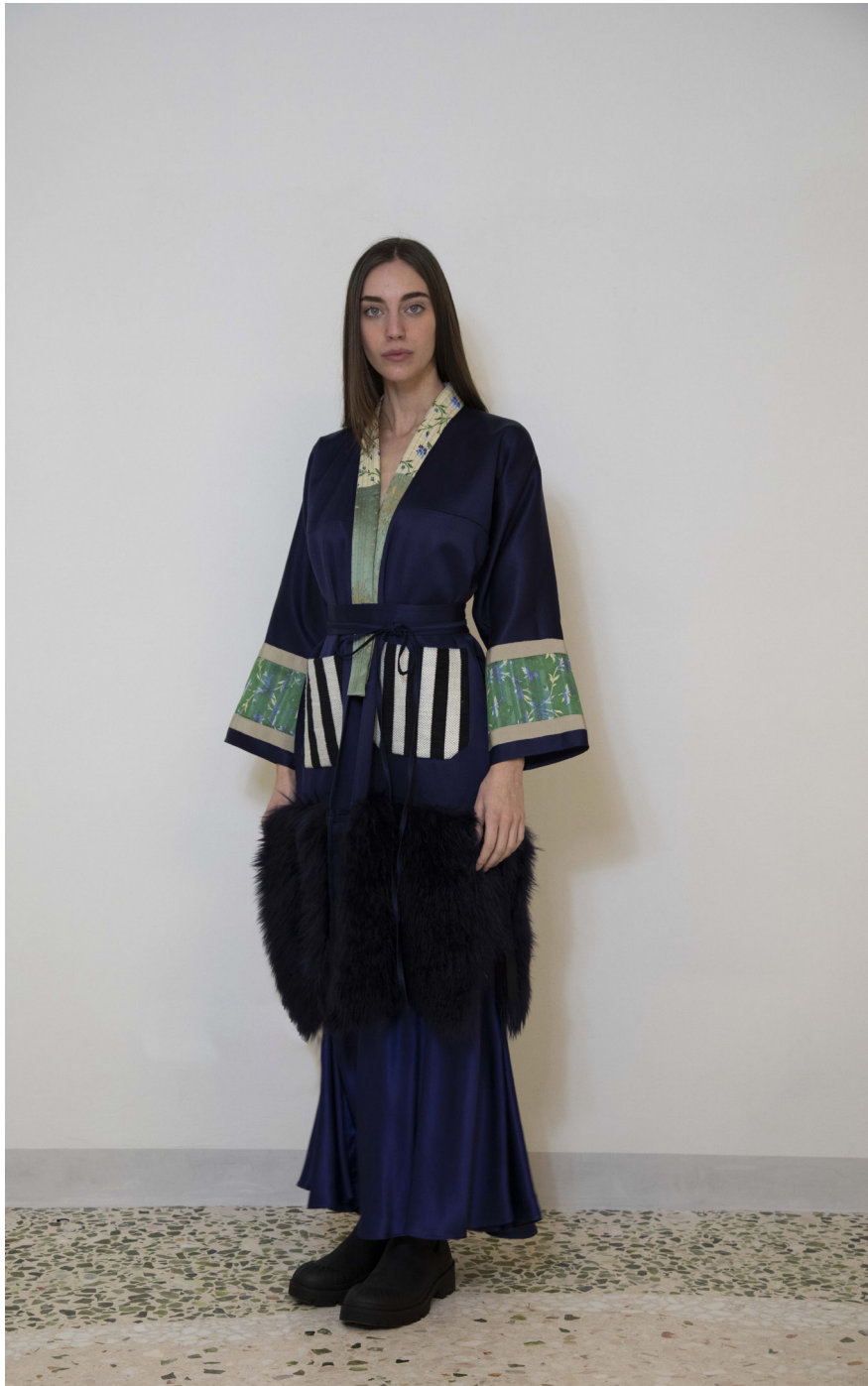
Midnight Oasis Coat – sapphire blue silk wool/ brocade patches/ capra kashmir fur trim in navy. Pale sand silk blend jacquard and jade silk wool. Fully reversible.