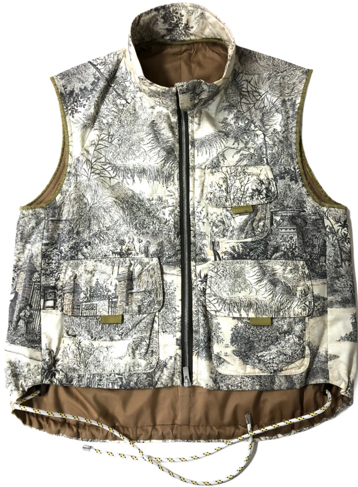
Fisher Gilet – multi pocket utility vest, lightly padded for extra comfort and protection, inspired by fishermen.